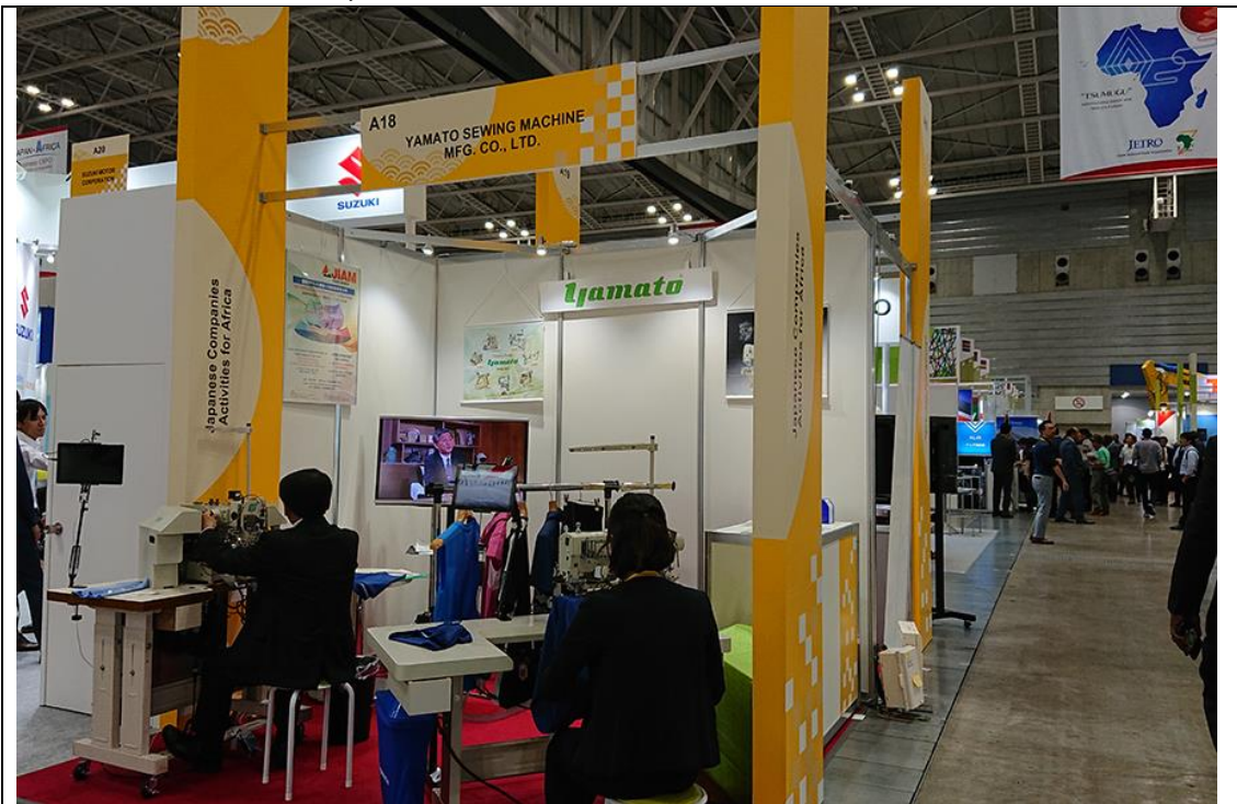
Yamato booth at "Japan-Africa Business EXPO"