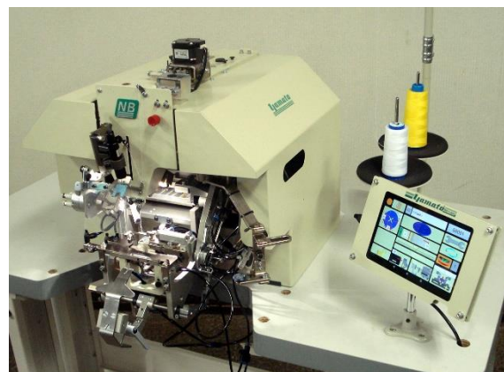
Electronic Button Sewer